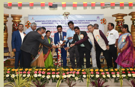
Inauguration of 34th IASLIC All India Conference

Indian Association of Special Libraries and Information Centres